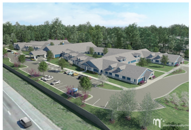
Above: Rendering of the entire project. (Layout in VersaCAD)